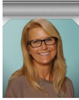
Stacy Mote Kindergarten